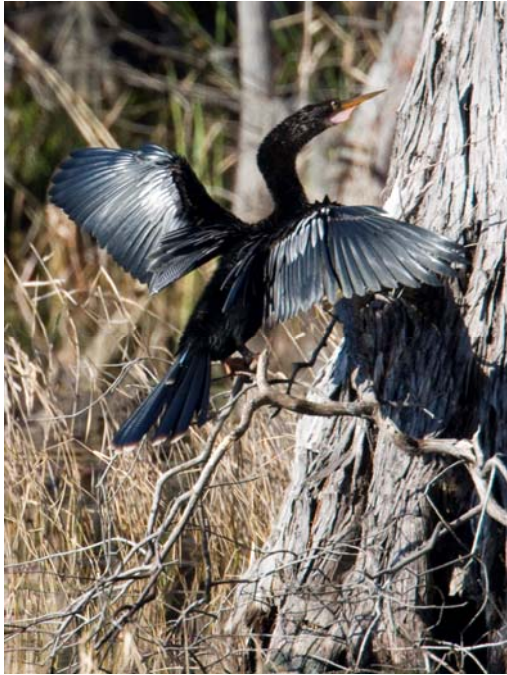
Anhinga warms in the sun